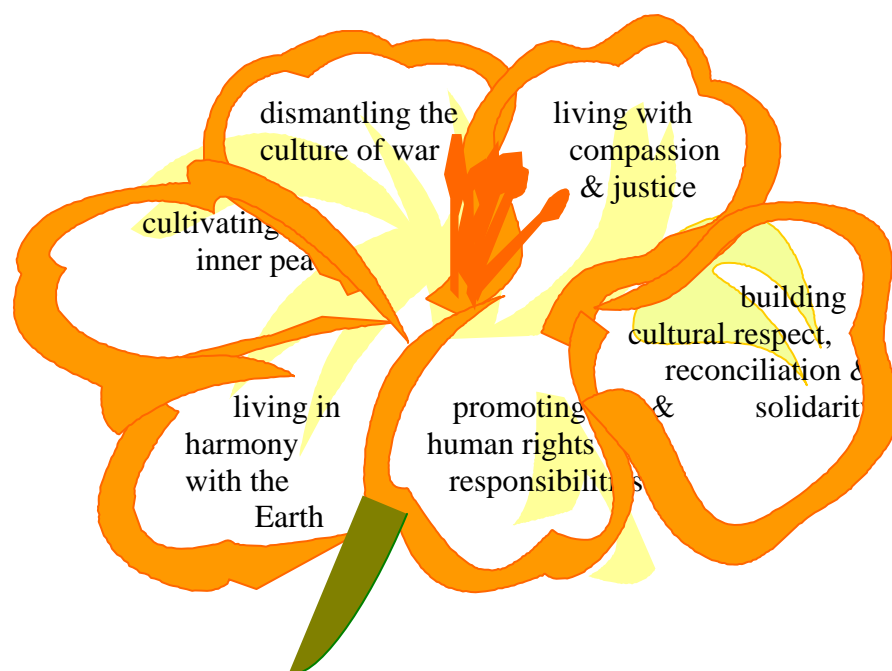
Fig 2: A holistic framework of EIU toward a culture of peace

‘living with compassion and justice’ , there is an equal concern for issues and problems related to economic development, especially the root causes of structural violence or local/global injustices. The EIU theme of promoting human rights and responsibilities is explicit as a value in ESD, while building intercultural respect and solidarity is no less important in ESD. Environmental sustainability issues constitute of course a major theme ( living in harmony with the earth ) in both ESD and EIU. While ESD raises concerns over democracy and political participation in its “society” dimension, in EIU such issues are cross-cutting through all the themes (e.g. democratic participation and empowerment of all citizens, especially the marginalized, are needed to overcome injustices rooted in the disproportionate power of elites as well as economic, bureaucratic and political institutions or agencies). Perhaps it is only in the two EIU themes of dismantling the culture of war and cultivating inner peace where the ESD framework appears to focus less explicitly. Nevertheless, as shown later, a holistic paradigm of ESD would necessarily integrate these themes and issues of peacelessness, as indeed has been the case in the vision and work of many environmental civil society movements.