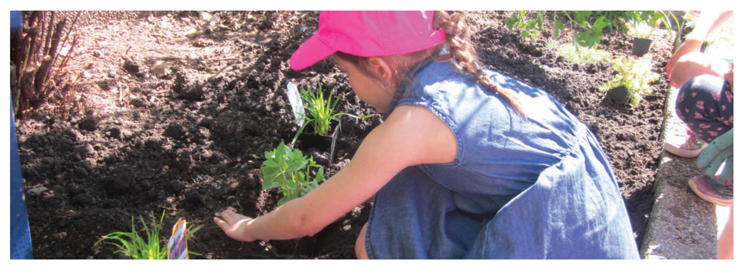
Pollinator garden Action Project at Dalhousie Elementary School in Calgary, AB

York Region District School Board Yukon Teachers' Association