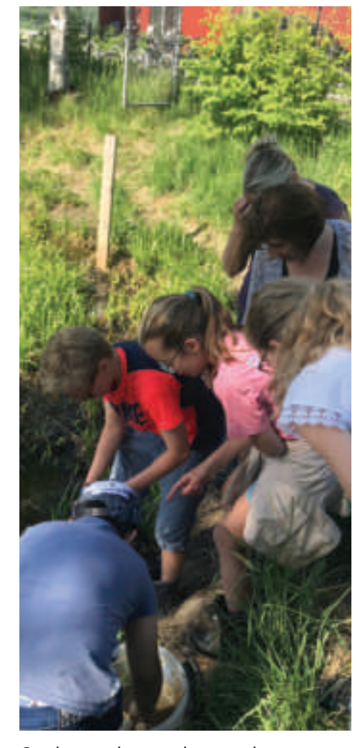
Students adopt endangered salamanders at Kjeller skole, Lillestrom, Norway

Canada and Norway have so much in common with respect to our economies, culture and education systems. Working together to share best practice serves to strengthen our Education for Sustainable Development programs in both countries!