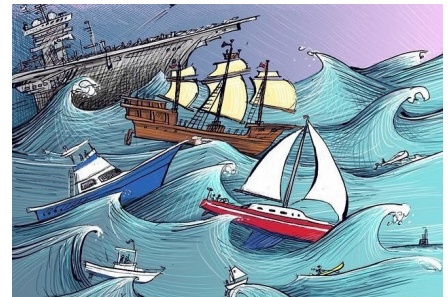
Illustration by Barbara Kelley

Show (paper or digital display - click image to enlarge) and discuss possible meanings of the drawing with a nearby partner. What concepts about society do you notice communicated in this picture?